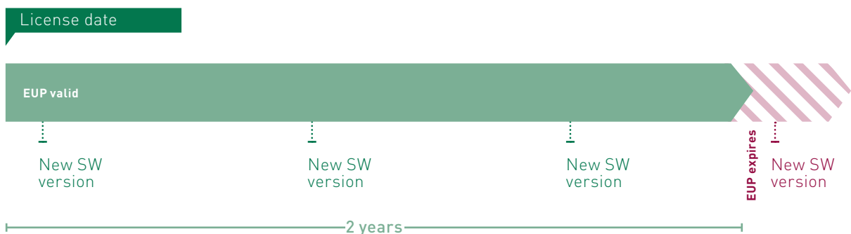
Fig. 1: iba software maintenance is free of charge for the first two years after purchasing the license